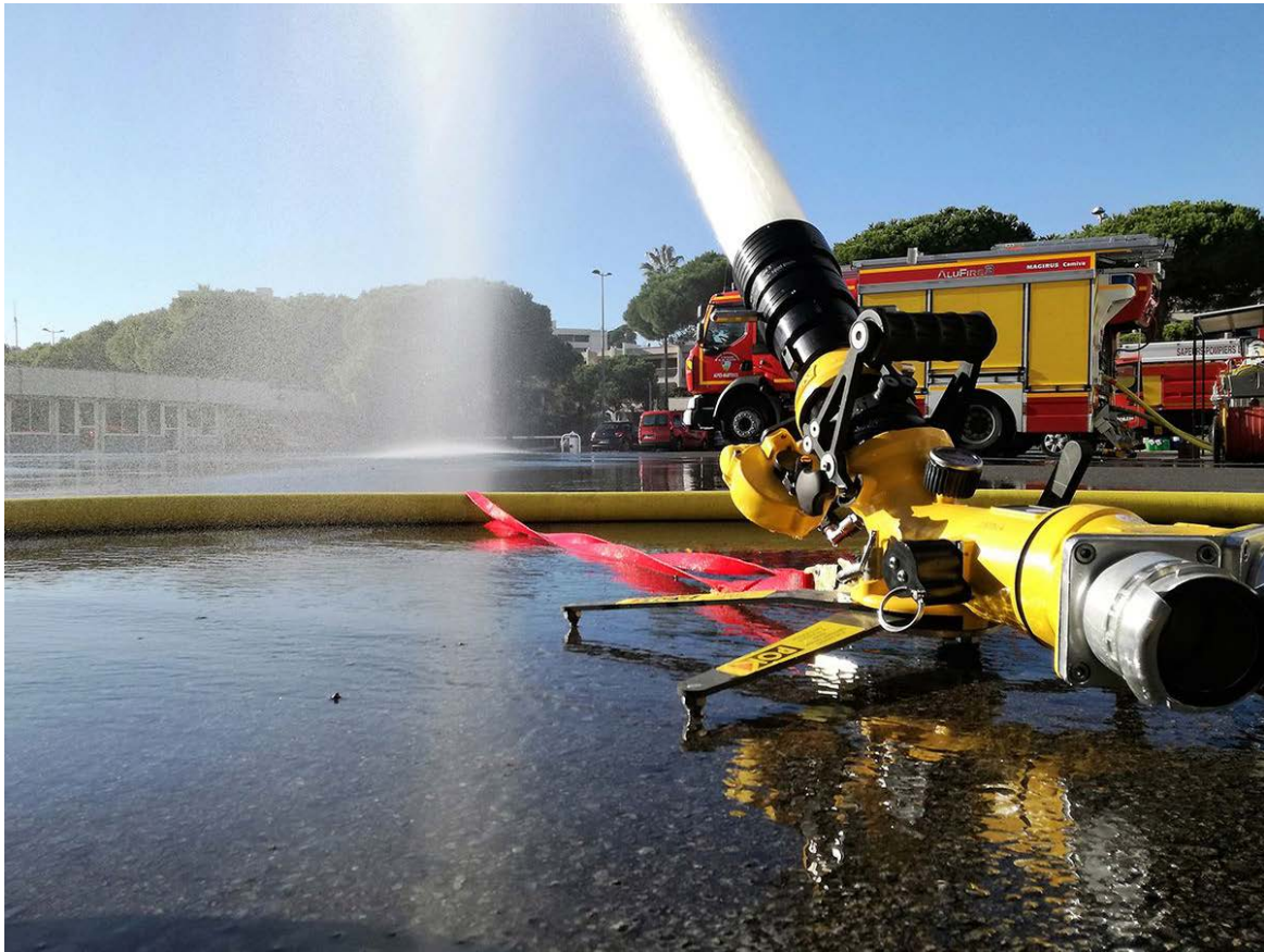
Demonstration of our Montmirail 4.000 L/Min monitor.

Recently, our French sales team went to the SDIS 06 (French fire brigade based in Nice) to present the Montmirail 4.000 L/Min.